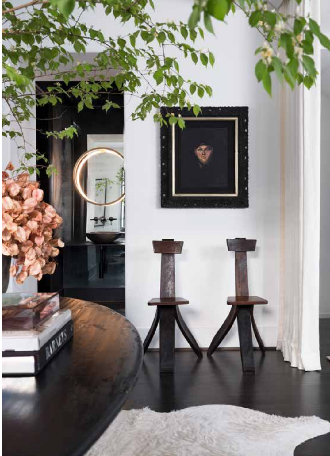
Moody Contrast Open to, but set back from, the living space, the powder room features an open-format vanity and accompanying water closet. The dark tone comes from a hand-troweled wall treatment by Tommy Taylor and Will Lawless of Southern Plaster.