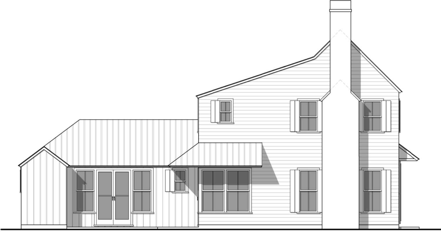
LEFT SIDE ELEVATION 10'-0" / 9'-0" CEILING