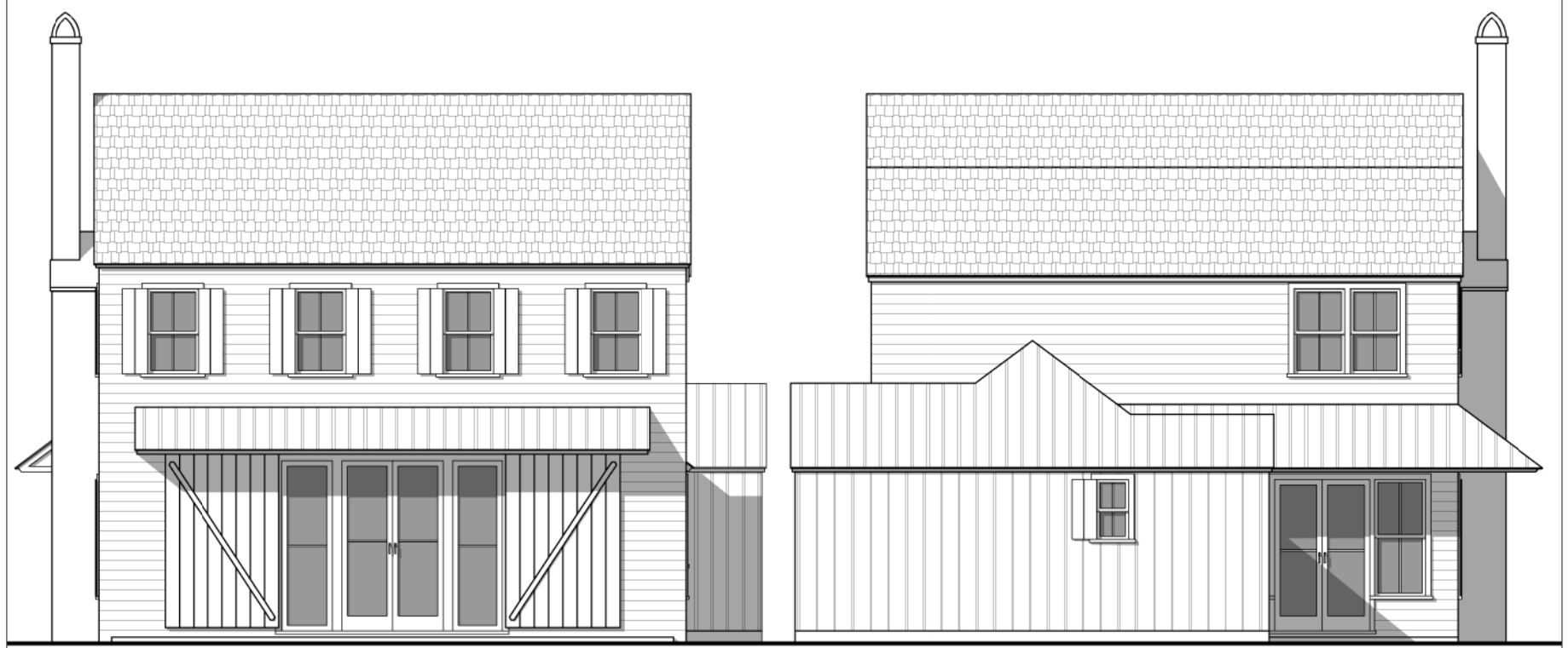
FRONT ELEVATION 10'-0" / 9'-0" CEILING