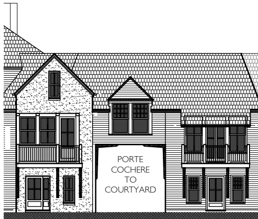
BUILDING ENTRY ELEVATION